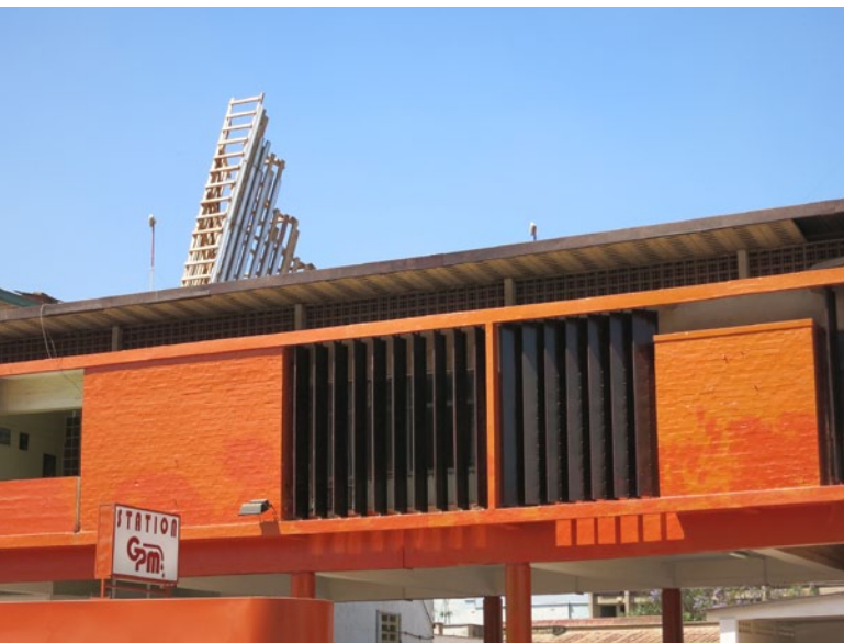
GPM Gas Station 72 Avenue Munongo – Lubumbashi Democratic Republic of the Congo